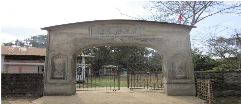
Gateway to the Ranachandi Temple at Barkhola, Bijoypur

Burmese invasions, she was secretly carried to Bijoypur where her honour would be secured. No inscription or any other archaeological remain has been found regarding the establishment of the Temple. The Temple is a recent renovation as the deity was originally enthroned in a tin shed. Here, Ranachandi is not worshipped in the Idol form but in the form of a sword which is kept concealed under a piece of cloth as no one is allowed to see or touch the sword. Here, Devi Ranachani is worshipped every Sunday. Besides this, every year in the Bengali month of Magh and Baishak, the Devi is worshipped with great pomp and grandeur.