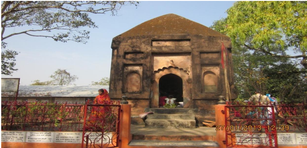
Sri Sri Bhuvaneshwar Temple in Chandragiri at sonai

month of Kartik, Sunday of Suklapakhysa every year