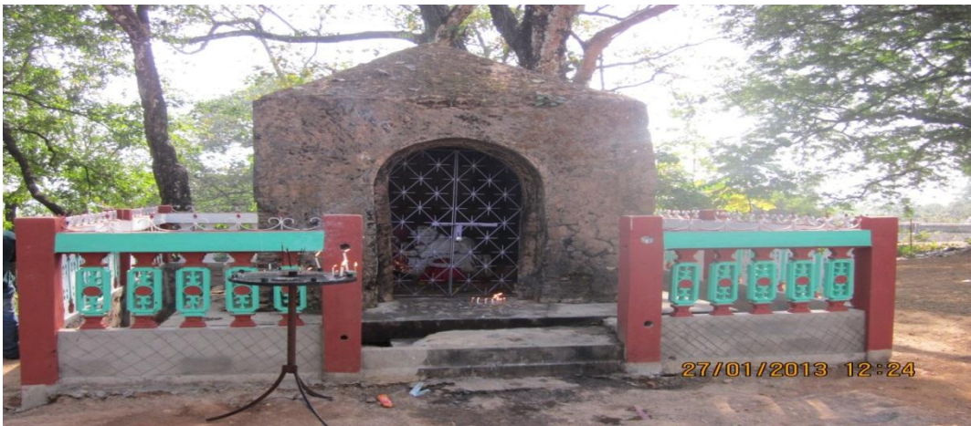
Picture of the Abandoned Structure just facing opposite to the main Temple