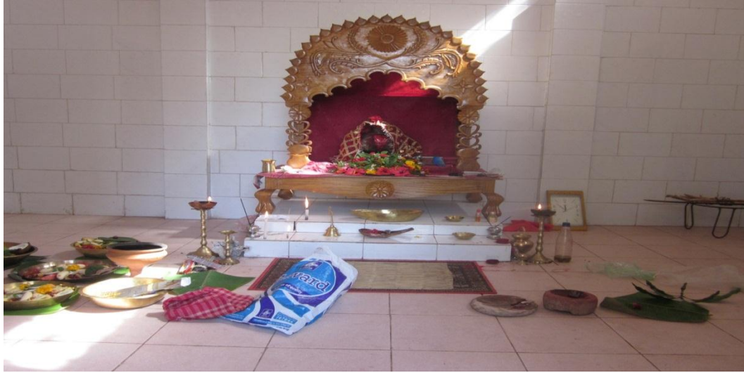
Inside View of the Temple of the Ranachandi Temple at Bijoypur, Barkhola