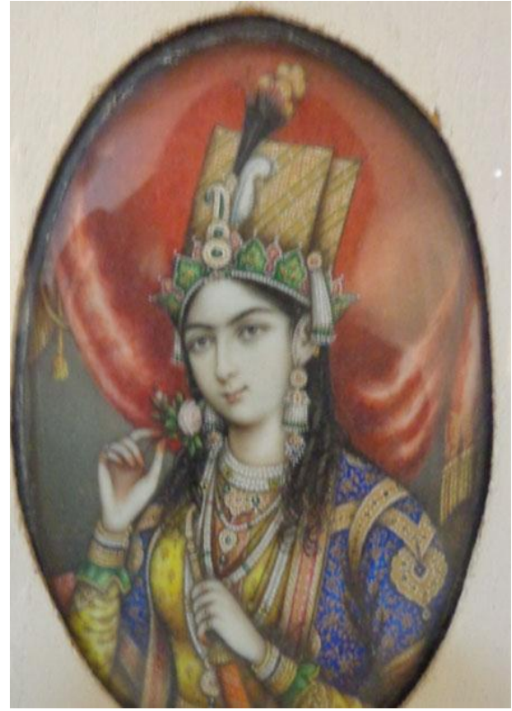
(Fig4) Miniature painting of Nurjahan .Patna Musuam.Bihar.