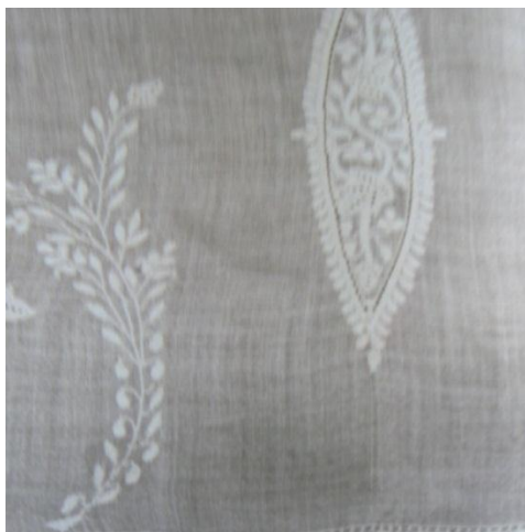
(Fig 1) chikankari work, discovered by Nurjahan Begam wife of emperor Jahangir.

The word Harem means a holly place or a sanctuary.(Ansari,1960).In times to come the word Harem acquired sanctity and respect. th term was evoked to denote a place where the women folk of the Royal Household lived.(Layden.1924).The women inside the Mughal Harem leads a luxurious life.(Fig 4) They spent their time to adorn themselves magnificently. The only purpose of their life is to please the lord of the Harem. so all of their activity was entered to attract him in various way. While describing the life inside the Harem, Manucci mentioned that the princess wore the turbans with the permission of the king. These turbans were highly fashioned along with various precious stones and pearls. The Mughal harem becomes the centre for the development of