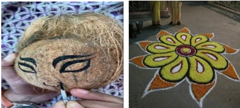
Figure 4: Coconut shell being used in idol face and flowers in rangoli decoration

Various crop grains, jute sticks, cane sticks, variety of leaves, flowers are extensively used for idol and pandal decorations. Coconut shells are now-a-days used to make the face of the idols instead of plaster of Paris. Rice powder, natural dyes, floral dyes and floral paints are widely used in rangoli decoration inside pandals. See Figure 4.