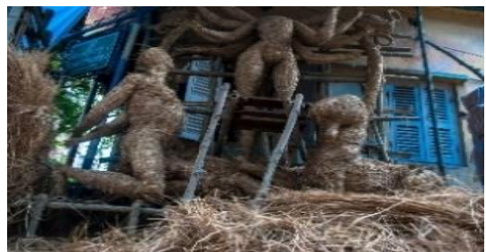
Figure 3: Structure of Pandal and Idol