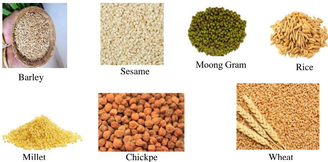
Figure 1: Sapta Dhanya : the seven grains used in Ghatasthapan

Before the actual worshipping, a pot (ghat) filled with soil and seven types of grains is worshipped in Akal Bodhan . These seven grains, namely, Barley, Sesame, Rice, Moong Gram, Millet, Chickpea, and Wheat as shown in Figure 1 are commonly known as Sapta Dhanya . This ritual is known as Ghatasthapan . These terms and all other terms derived from Sanskrit are italicized throughout the paper. They signify the commencement of a new agrarian cycle and upcoming harvest. An example of ghat used as part of Ghatasthapan is shown in Figure 2.